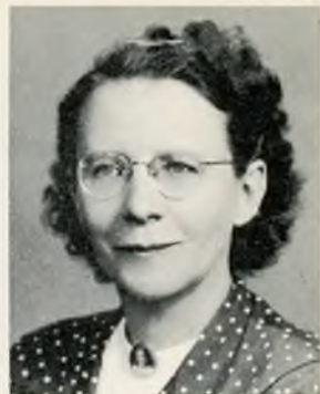
B. IONE PALMER Library