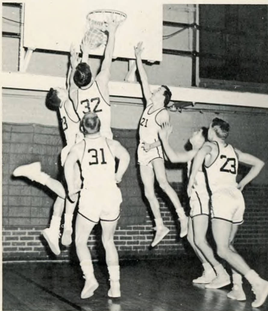
Northville High School Library Northville, Michigan