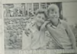
THE FLETCHERS AND FLETCHER